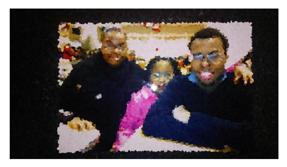
Figure 1. My brother and sister - from an adopted child's photo-album

opportunity to explore and compare divergent/convergent meanings associated to the particular images. Perhaps it would be possible to explore these aspects of family experience through other (non-visual) research techniques -such as semi-structured interviews, written diaries, etc.- but our argument is that using photographs has facilitated greatly the process or, potentially, uncovered elements that would have remained invisible through other research approaches.