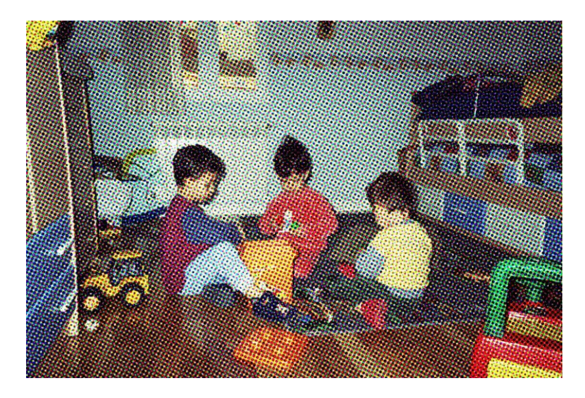
Figure 2. Three siblings playing

For example, the two images below apparently depict similar scenes: children playing in their rooms. Yet, the first one (Figure 2) was taken by the parents and depicts the three siblings playing together and, from our perspective, could be seen as primarily a parental perspective (and ideal) of what "quality evening time" at home should look like. In contrast, the second image (Figure 3) was taken by the older sister (and key participant of the study) and primarily, again from our perspective, can be seen as a way to capture her fraternal relationship and the importance of her brother in her daily life.