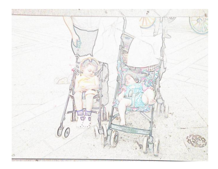
Figure 4. Me and my cousin - selected by participant as an adolescent

stories" (Bruner, 2003; Labov, 1972). Methodologically, this means that photographs are brought to the the research interview layered with multiple interpretations past conversations and among family members. Consequently, more meaning can be extracted from individual photographs rather than necessarily from the global portrait provided by the full set of photographs (although this collective analysis can also be conducted). Figure 4 illustrates some of these qualities. It was selected by an adopted adolescent and portrays her and her cousin sleeping in strollers during a walk in a family reunion trip. The photograph was taken when they were toddlers, so most probably the stories around the photograph are not drawn from her "individual" memories and recollections of the event. Rather, as transpired during the conversation around this photograph, what provides meaning and personal relevance to this photograph are the stories told by her parents and other family members from/around the image, the relationship that has developed since then with her cousin or the accumulated meanings of successive "family reunions" -i.e. narrative events and experiences that unfold beyond the place and time depicted in the photograph.