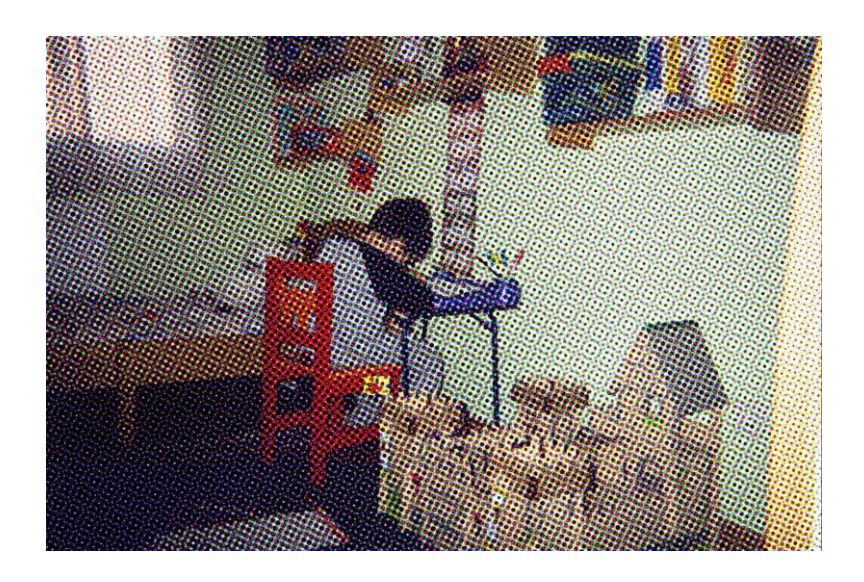
Figure 3. My brother in his room