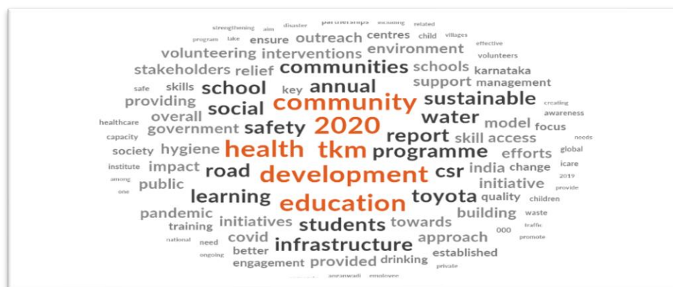
Figure 4: Word Cloud of Toyota and Kirloskar Motor Ltd.

Website analysis(Figure 4) of Toyota Kirloskar Motor Ltd indicates the words such as “community”,”education”,’sustainable”,”learning”,”students”,”stakeholders”,”water”,”government” among others.As argued by Hetze, K., & Winistörfer, H. (2016), CSR communication on the website/social media contributes effectively to corporate legitimacy.