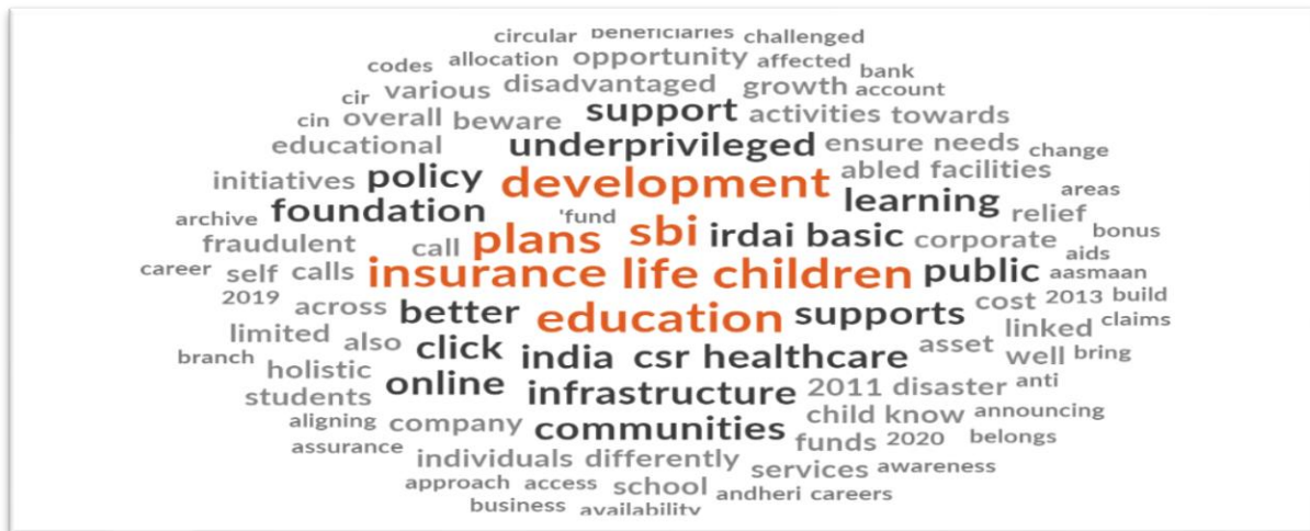
Figure 2: Word cloud of State Bank of India using NVivo

Text analysis of CSR communication from the SBI website (Figure 2) highlights the following words: "Children", "healthcare", "Education", "underprivileged", "infrastructure", "communities" among other CSR-related words. European companies tend to use more sustainability-related terms in their CSR reports compared to the past (Gatti and Seele, 2004). The same is evident in the following analysis, where Indian companies such as SBI and AXIS use sustainability-related terminologies in CSR communication.