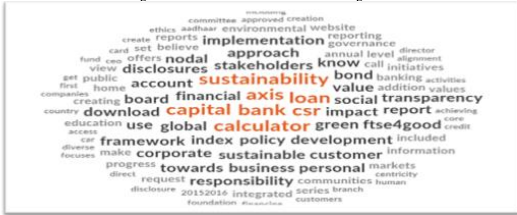
Figure 1: Word Cloud of AXIS Bank using Nvivo