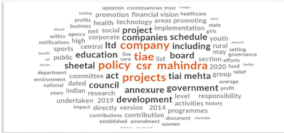
Figure 3: Word Cloud of Mahindra and Mahindra Ltd

foundation corporate trust, Tech Mahindra foundation). In-depth analysis from the words emerged out from the word cloud of website analysis from the company website reveals CSR activities are mainly carried out through Internal agency. CSR activities revolve more around youth, education, and rural development.