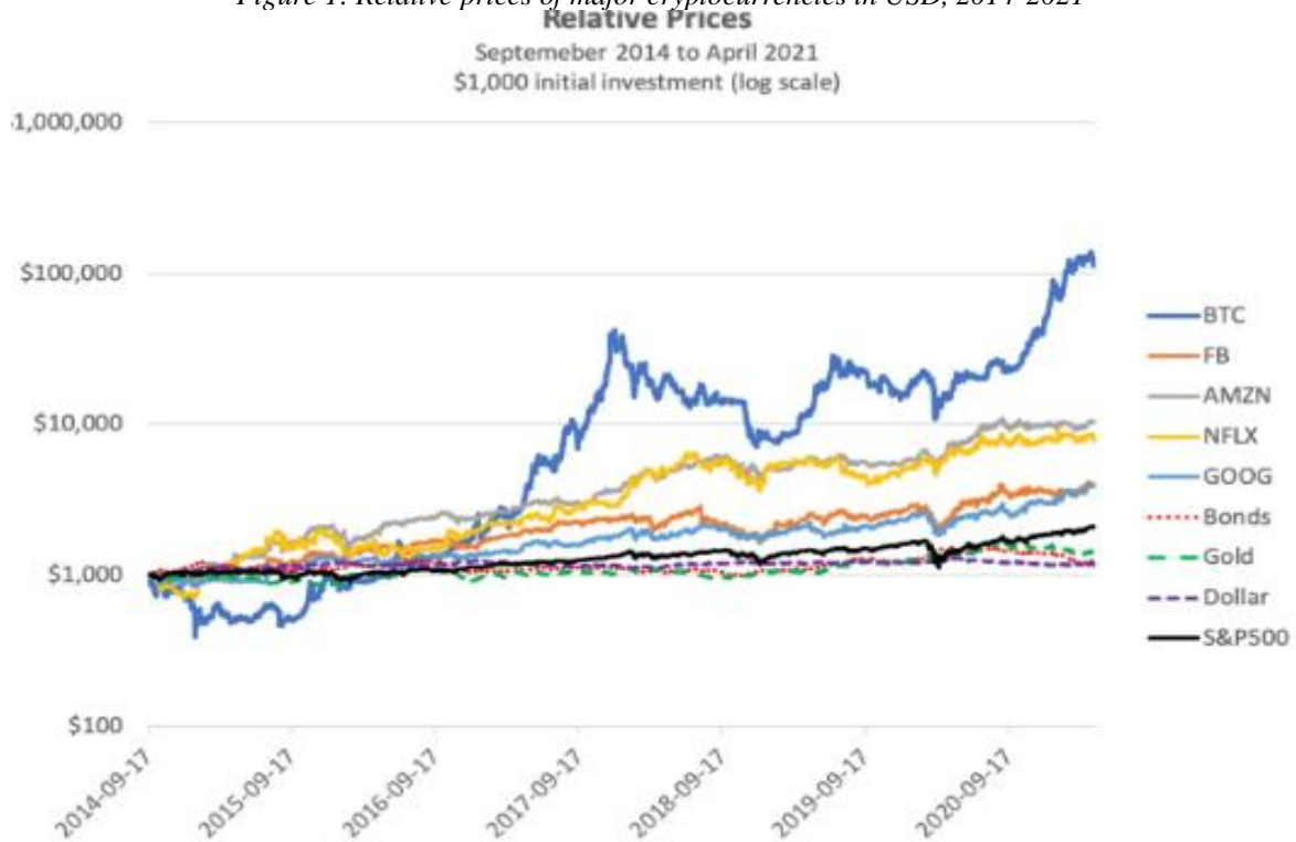
Figure 1: Relative prices of major cryptocurrencies in USD, 2014-2021