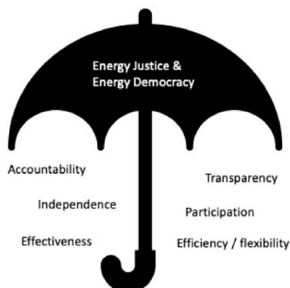
Figure 1. Umbrella function of Energy Justice and Energy Democracy.