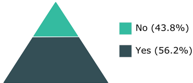
FIGURE 2. PUBLIC OFFICIALS' RESPONSE TO THE QUESTION: DO YOU THINK THAT THE WAY IN WHICH THE METHODOLOGY FOR THE CALCULATION OF FINES HAS BEEN FORMULATED CAUSES SOME COLOMBIAN REGIONAL OR LOCAL ENVIRONMENTAL AUTHORITIES TO REFRAIN FROM IMPOSING FINES ON THOSE WHO HAVE COMMITTED ILLEGAL TRADE OF WILD FAUNA?

environmental authorities to refrain from imposing fines on the illegal trade of wild fauna (Fig. 2). Accordingly, most of the officials believe that the mentioned methodology should be modified in some aspects (Fig. 3).