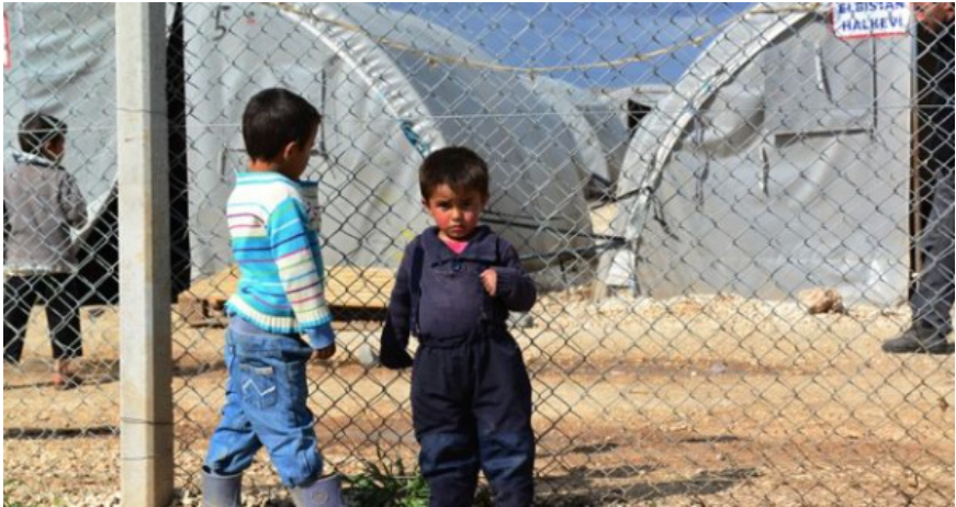
Figure 1. The number of children are increasing in Armies in many Countries

are may human right organizations who are opposing the children used in war. But this is a dirty true that it is very difficult to stop this because the whole country is involved in this. There are some African countries, Siria, Yemen, Colombia etc where the maximum children used in war. There are many countries who believes only the last son of family who will be included in the activities like war. The children in such cases fall in depression and mental sickness.