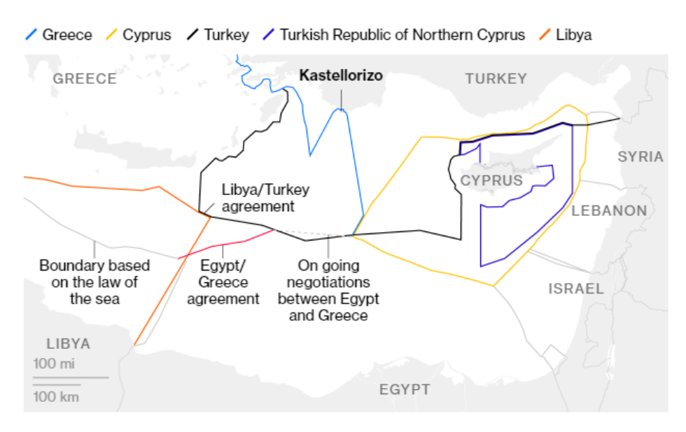
Figure 1: Competing claims over the Eastern Mediterranean