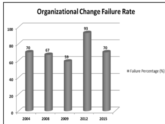
Fig.1. Organizational Change Failure Rate. Year 2004, 2008, 2009, 2012, 2015.