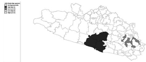
Figure 2 shows the violence index of 1999 and 2014, which is used to analyze the spatial agglomeration of insecurity. What we find is that the high-high growth of insecurity occurred in the municipalities of Acapulco de Juárez, Coyuca de Benítez and Chilpancingo de Los Bravos (darker-upper color), while in 2014 there were only two municipalities that were belonging to a violent cluster /o cluster of violence.