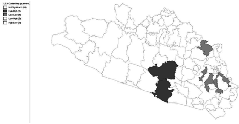
Figure 2. Lisa Cluster map for the violence index, 1999 and 2014.