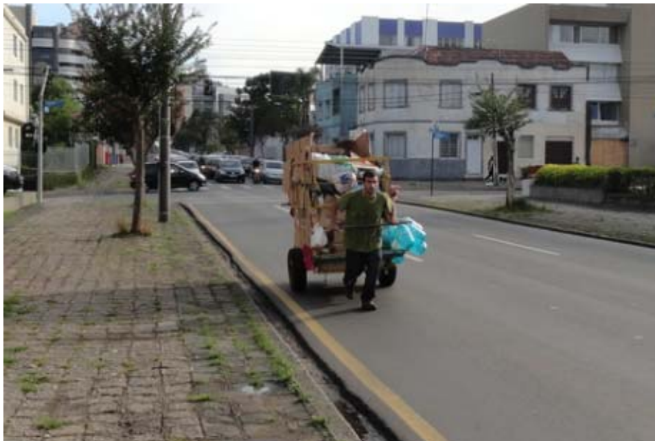
Figure 1 - Scavenger with his trolley, collecting on the streets

Hence the selective collection made by the scavengers is, according National Movement of recyclables scavengers from Brazil (MNCR, 2007), a new model to perform the selective collection. Preferably consists of, instead of the municipal agency collect the selected material, the collectors, duly registered and organized, would do it.