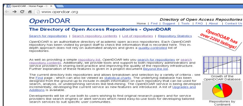
Fig. 1.Home of Directory of Open Access Repositories